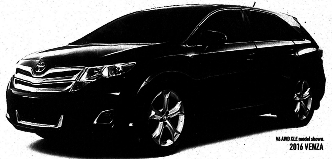
V6 AWD XLE model shown. 2016 VENZA